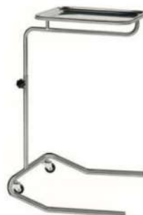
Mayo Table 2 Castors And Skid Feet