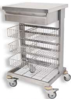
Critical Care Cart