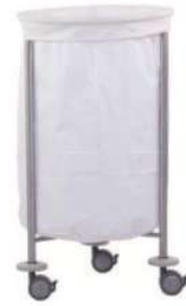
Dirty Linen Trolley Single Bag Round