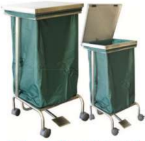
Linen Skip With Lid

Medical linen trolleys are for nursing homes or hospitals. Facilitates daily tasks and routines of cleaning and transporting laundry for medical professionals.