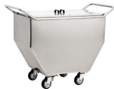
Medical Waste Trolley