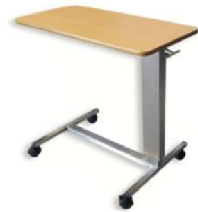
Over bed Table