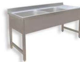
Sink Table with Back Splash