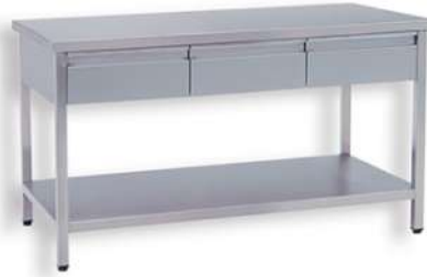
Center Type Table with Under Shelf and Drawers