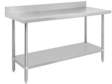
Wall Type Work Table with Back Splash and under Shelf