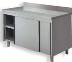
Base Cabinet with Sliding Doors