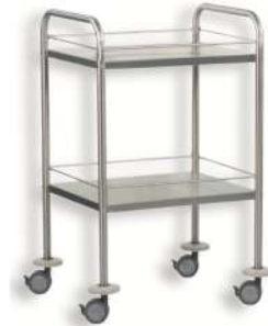
Instrument Trolley with Side Rails