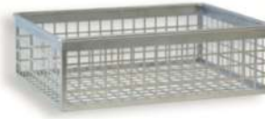
Perforated Sheet Basket