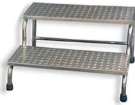
Double Step Foot Stool