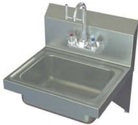
Hand Wash Sink