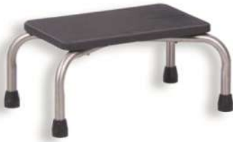
Single Step Foot Stool

Made from non-magnetic stainless steel pipes and rubber padding available upon request.