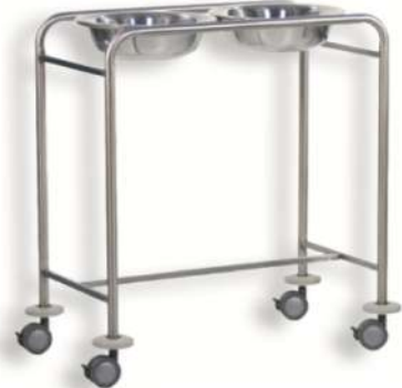
Double Basin trolley