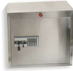
Narcotic Cabinet with Electronic Lock