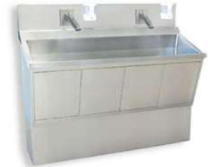
Double Station Scrub Sink