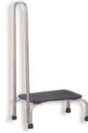
Single Step Foot Stool with Hand Rail