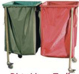
Dirty Linen Trolley Single Bag Square