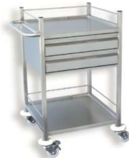
Dressing Trolley with Double Drawers