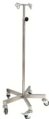
Heavy Duty Infusion Stand