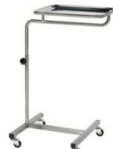
Mayo Table- 4 Castors