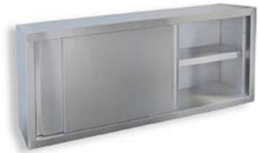
Wall Cabinet with Sliding Doors