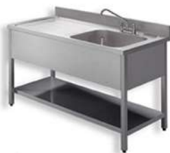
Work Table Single Bowl