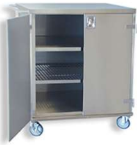
CSSD Transport Trolley