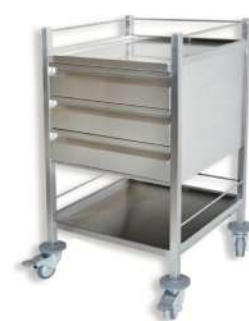
Dressing Trolley with Triple Drawers