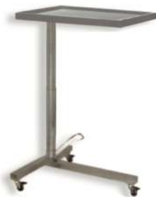
Mayo Trolley- Hydraulic