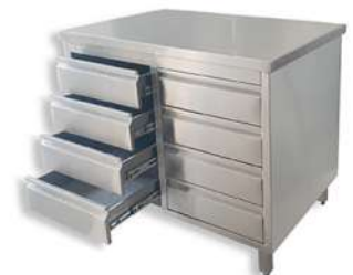
Cabinet with Drawers