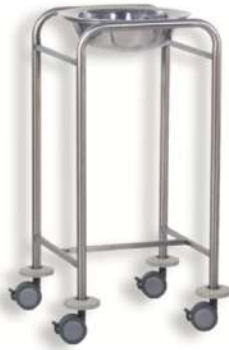
Single Basin trolley