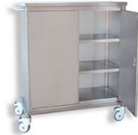
Clean Linen Cart with Hinged Doors