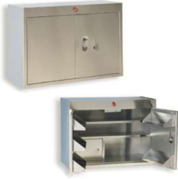
Narcotic Cabinet with Double Doors