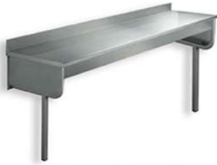
Work Table Wall Mounted