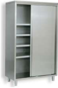
Upright Cabinet 2 Solid Sliding Doors