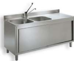
Double Bowl Sink