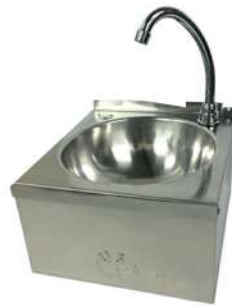
Hand Wash Sink