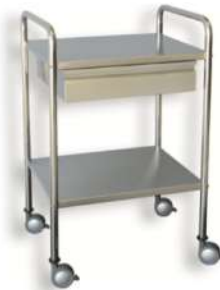
Instrument Trolley with Drawers