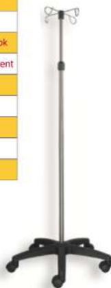
Infusion Stand Nylon Base