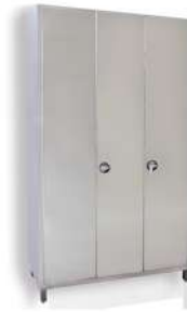
Upright Cabinet 3 Hinged Doors