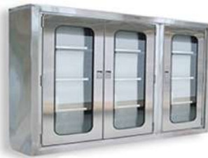
Wall Cabinet with Glass Inserted Hinged Doors