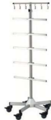
I.V. Pump Stand

WE ALSO UNDERTAKE CUSTOMIZED STAINLESS STEEL FABRICATION