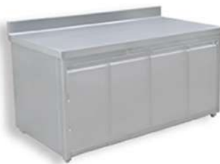
Base Cabinet with 4 Hinged Doors