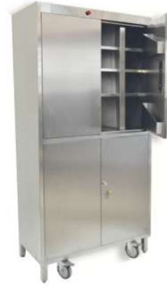
Narcotic Cabinet with Wheels