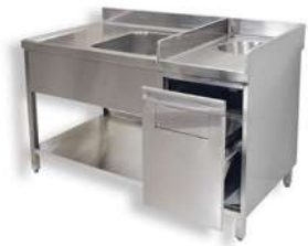
Table with Single Bowl Sink, Hand wash & Pull