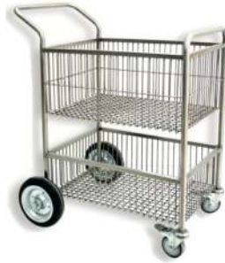
Multi Purpose trolley