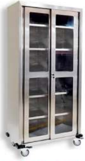
Upright Cabinet 2 Sliding Glass Doors