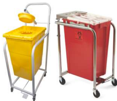
Sharps Bin Duo Trolley