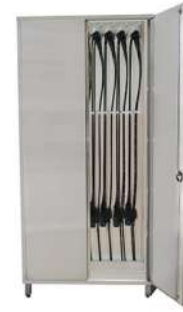
Endoscopic cabinet with Two Solid Doors & Back Side Hanging