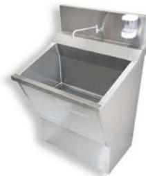
Single Station Scrub Sink