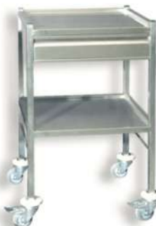
Dressing Trolley with Single drawer